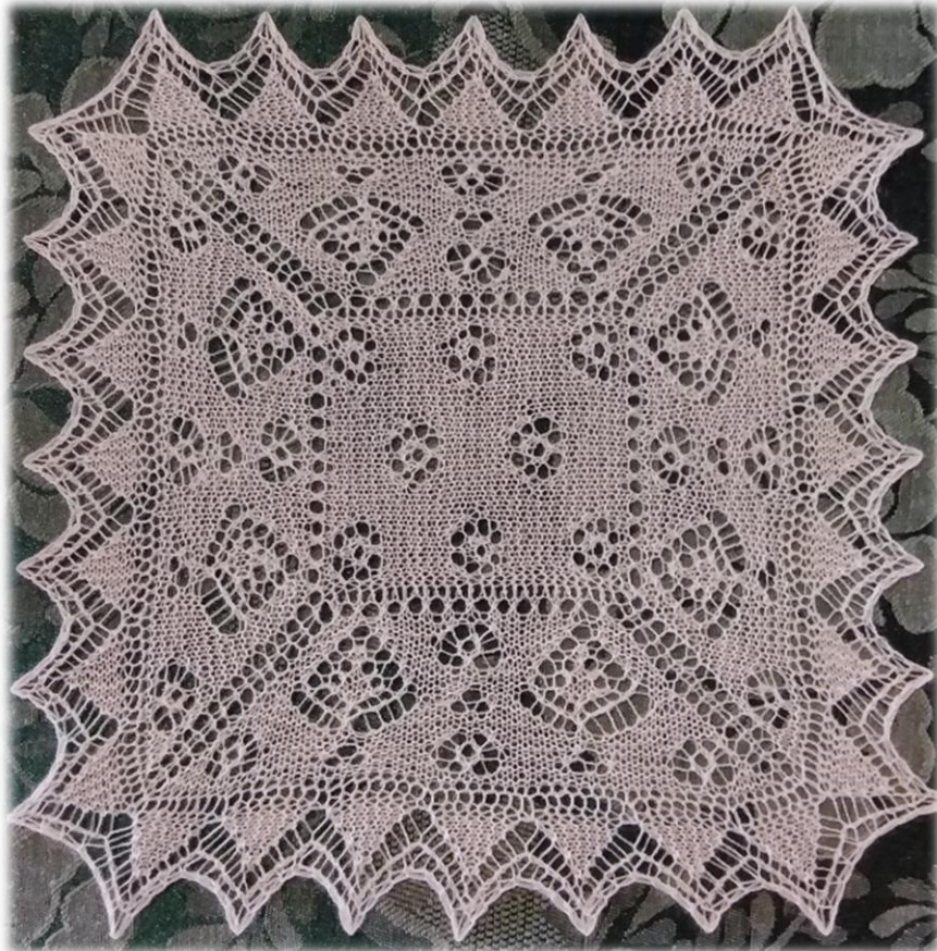
Miniature Shetland Style Lace Shawl